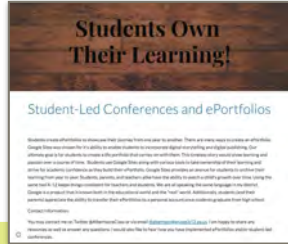
Student-Led Conferences and ePortfolios