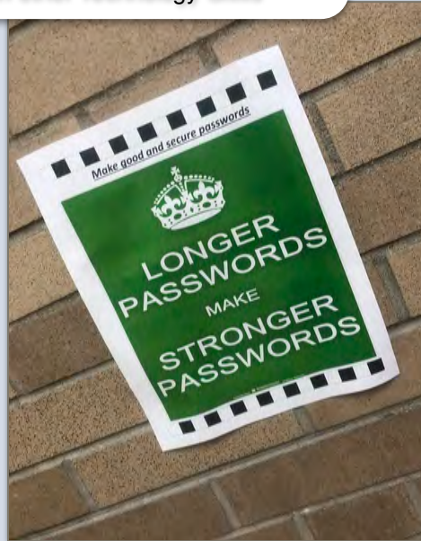
Encourage Good Password Habits

Examples of some of projects done by the students are shown in the images to the right.