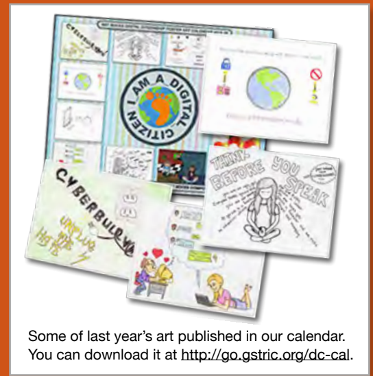
Some of last year's art published in our calendar. You can download it at http://go.gstric.org/dc-cal .

All students in GST BOCES Component School Districts are invited to participate for a chance to have their work published in a Digital Citizenship Calendar. Entries should feature original artwork illustrating safe use of the Internet and/or mobile devices.