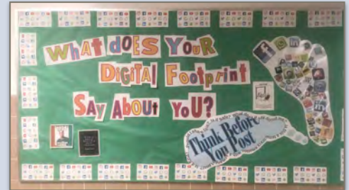
Digital Footprint Posters