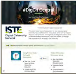
ISTE Digital Citizenship Network