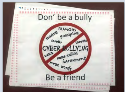
Posters on Cyberbullying/Other Topics